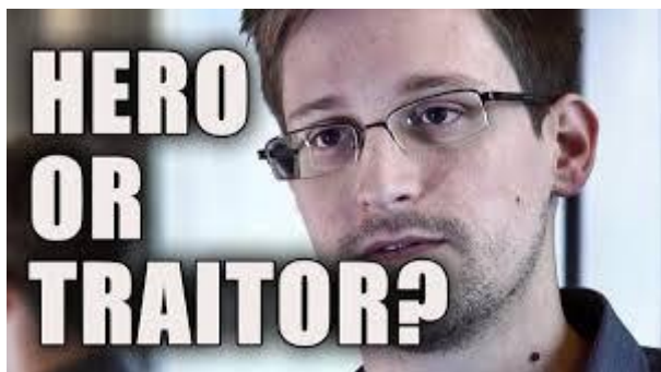
Topic of the week: (Click for details)