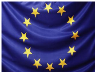
Topic of the week: (Click for details)