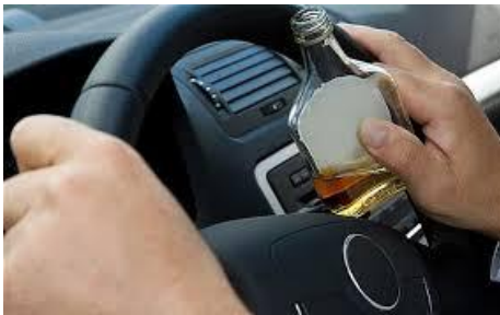
Topic of the week: (Click for details)