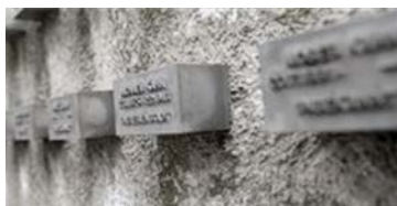
Topic of the week: (Click for details)