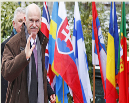
GREEK PM GEORGE PAPANDREOU ARRIVES AT THE SUMMIT OF EUROPEAN LEADERS IN BRUSSELS

Prime Minister George Papandreou has announced tough austerity measures aimed at cutting his country's soaring public debt, amidst a grave financial crisis. Meanwhile Portugal's opposition-led parliament has passed a bill on regional finance, turning down a mooted government austerity plan.