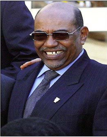
General Omar al-Bashir, President of Sudan, the first head-of-state indicted by the International Criminal Court (ICC) for genocide, war crimes, and crimes against humanity

despite it being a nonbinding, advisory opinion. The question being pondered in the international Court simply seeks to confirm whether Kosovo's declaration of independence accords with international law.