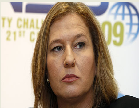
TZIPI LIVNI, ISRAEL'S FORMER FOREIGN MINISTER

Last year following the issue of UN-sponsored Goldstone report, both Israel and the Palestinians were asked to investigate accusations of human-rights violations committed during the conflict in the Gaza Strip. In the wake of this development a British court issued an arrest warrant against Tzipi Livni, Israel's former foreign minister, for her role in orchestrating Israel's military offensive against Hamas. The supporting legislation was under the controversial 1988 Criminal Justice