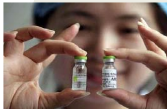
CHINESE H1N1 INFLUENZA VACCINES

Representative of WHO has declared Chinese-made swine flu vaccine to be safe and effective as more than 300,000 people have been vaccinated since late September. Meanwhile in a new medium, Kidneys are being freely traded on the Internet providing huge profits for the organ brokers. The world's largest Internet search engine has been in negotiations with China's copyright watchdog for scanning works for its online library without permission. China's Minister of Public