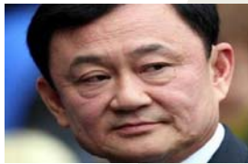
FORMER THAI PREMIER THAKSIN

Thailand plans to review all bilateral agreements and cooperation