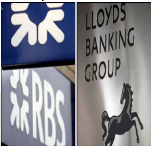
RBS AND LLOYDS- BRITISH RETAIL BANKS

The British government moved Tuesday to break up the country's two biggest retail banks, imposing a major shakeup on the financial sector as it exacts