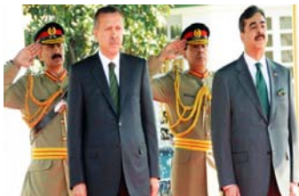
Turkish PM during his Pakistan visit

The government halted the return of PKK members to Turkey which was triggering resentment within public and opposition parties. The Prime Minister has decided to hold a summit to discuss Kurdish issue. While accusing the Military of planning to intervene in political affairs, civil society organizations launched a three-day rally. In the meantime Turkish PM has denied any chances of early elections.