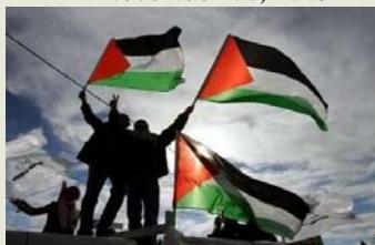
PALESTINIAN STRUGGLE- SLOW RECONCILIATION

Many people in the Palestinian territories think Hamas is mostly responsible for the absence of a national reconciliation pact, according to a poll by the An-Najah National University . 40.8 per cent of respondents share this opinion, while 22.4 per cent blame Fatah for the delay in signing an agreement. November 06, 2009