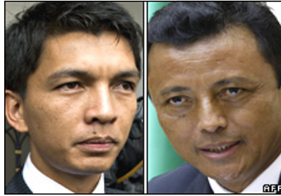
BOTH MR RAJOELINA AND MR RAVALOMANANA CLAIM TO BE PRESIDENT

UN Secretary General Mr. Ban's spokesperson said the UN would continue to support Madagascar "through the transition and beyond," led by former Mozambican president Joaquim Chissano, who has been working with the African Union (AU), the Southern African Development Community (SADC) and the