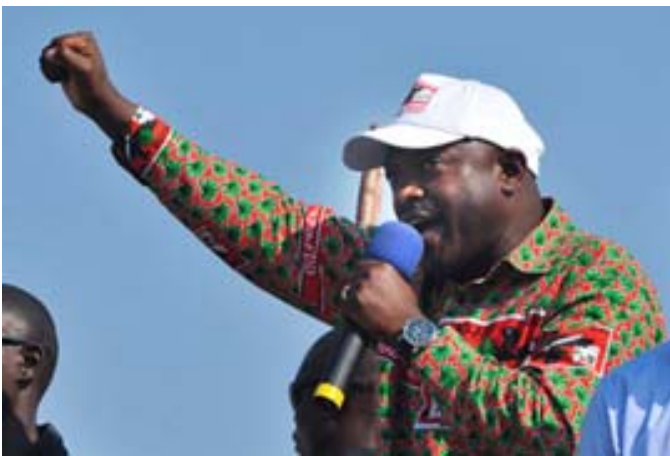
Nkurunziza was the only candidate after six opposition candidates pulled out

In Burundi all opposition parties pulled out of presidential election on 28 Jun, saying the ruling party used fraud to win local elections in May. Incidents of violence and opposition boycotts have cast a cloud over hopes for democratic reform.