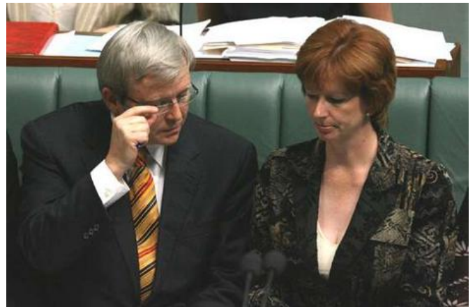
Kevin Rudd and Julia Gillard

Meanwhile Australia's new prime minister said she used her first telephone conversation with President Barack Obama last week to assure him the country's military commitment to Afghanistan would not change under her leadership. Some observers have speculated Prime Minister Julia Gillard may push for an early withdrawal of Australia's 1,550 troops from Afghanistan as the war loses popularity among Australians and elections loom. §