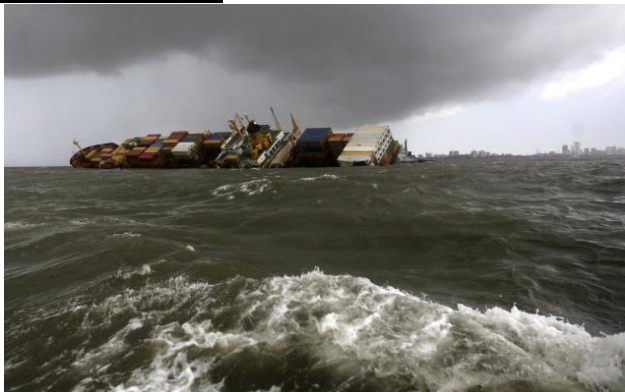
The Panamanian-registered container ship MSC Chitra that had on Saturday collided with the MV-Khalijia-II, a St. Kitts registered ship, tilts in the Arabian Sea, close to Mumbai.

Increase in inflation has been observed in India . The survey of 342 companies across sectors like auto, textiles, metal, chemical, FMCG, has predicted the slow down given the gradual phasing-out of monetary and fiscal stimulus and increase in raw material prices which could depress the demand through inflationary pressure. The manufacturing sector had grown by 15.1 % in the April-June quarter this fiscal.