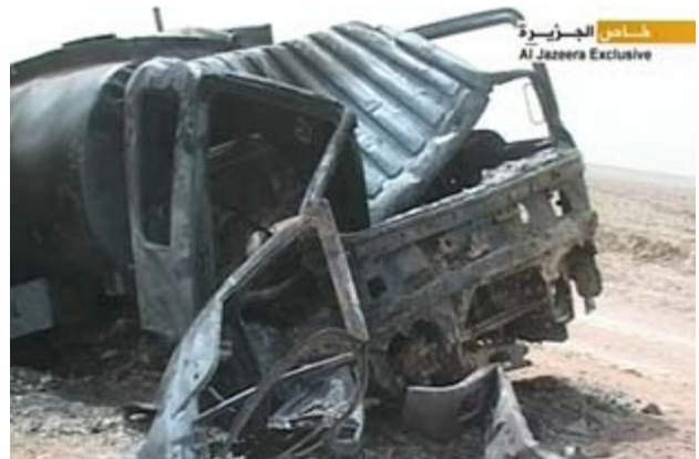
Taliban says its attack forced the US forces to leave their nearby base but Nato denies claim

Large number of people were killed and injured and thousands of acres of crops got destroyed by flash floods in three central and two eastern provinces of Afghanistan .