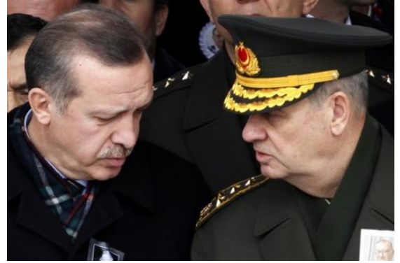
The ongoing clash between the Erdogan government and the military brass has spotlighted longstanding tensions in Turkey's political and social culture

on Islamic headscarves at universities. This year, the AKP was irked by the decision of the HSYK, a panel of the judiciary known for its anti-government stance, to fire a prosecutor who was investigating an alleged coup attempt against the government. Now the AKP says the constitutional court and Turkey's Supreme Board of Judges and Prosecutors ( HSYK ) need to be reformed. Critics say the government wants to control the judiciary. In the same stead it is feared that if such an amendment is passed the secular nature of the Turkish republic will cease to exist.