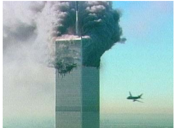
Terrorism as Most Important U.S. Problem

The dramatic jump in perceptions of terrorism as the most important problem between September and October 2001, however, serves as a reminder of the potential for terrorism to reclaim its prominence as a concern should there be new terrorist incidents in the future.