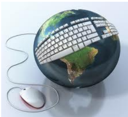
Topic of the week: (Click for details)