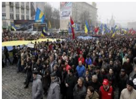
Topic of the week: (Click for details)