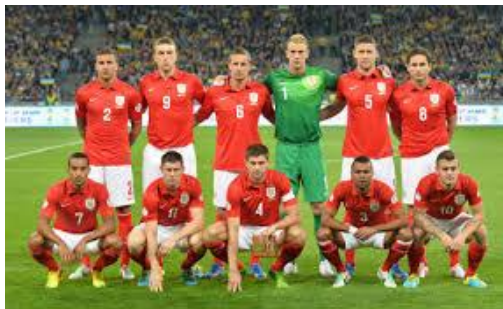
Topic of the week: (Click for details)