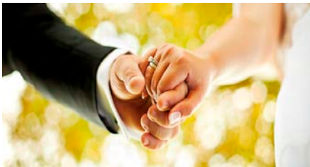
Topic of the week: (Click for details)