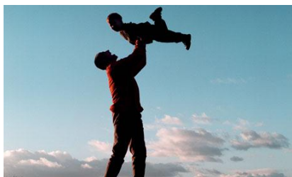
Topic of the week: (Click for details)