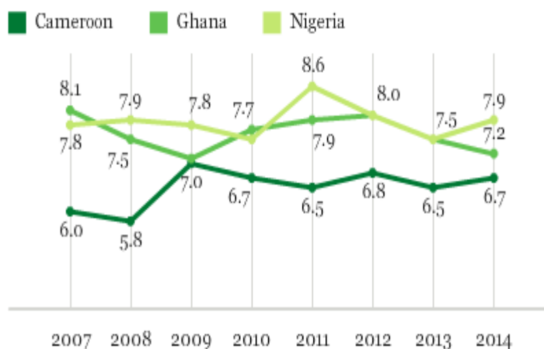
Western Africa -- Future Life Evaluation Mean Scores

Please imagine a ladder with steps numbered from zero at the bottom to 10 at the top. Suppose we say that the top of the ladder represents the best possible life for you, and the bottom of the ladder represents the worst possible life for you. Just your best guess, on which step do you think you will stand in the future, say about five years from now?