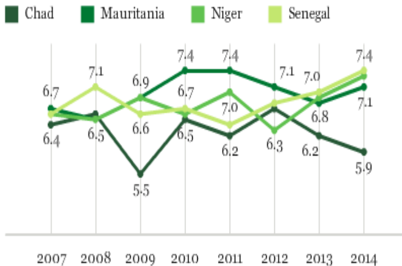
Sahel Region -- Future Life Evaluation Mean Scores

Please imagine a ladder with steps numbered from zero at the bottom to 10 at the top. Suppose we say that the top of the ladder represents the best possible life for you, and the bottom of the ladder represents the worst possible life for you. Just your best guess, on which step do you think you will stand in the future, say about five years from now?