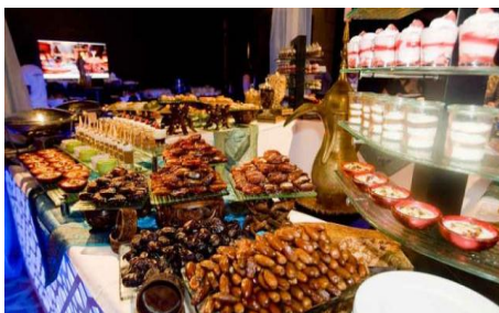
Topic of the week: (Click for details)