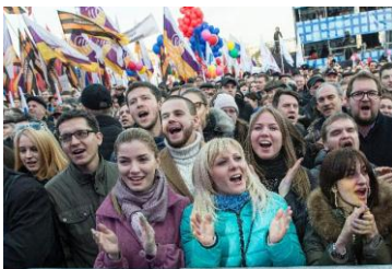
Topic of the week: (Click for details)