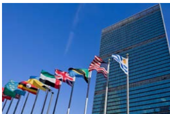
Topic of the week: (Click for details)