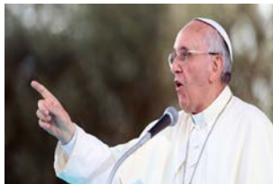
Topic of the week: (Click for details)