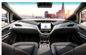
Topic of the week: (Click for details)