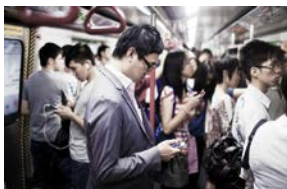
Topic of the week: (Click for details)