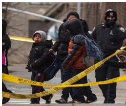
Topic of the week: (Click for details)