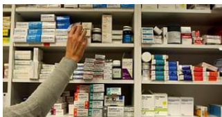
Topic of the week: (Click for details)