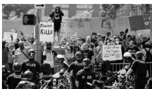
Topic of the week: (Click for details)