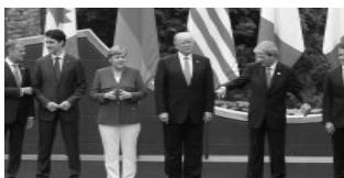
Topic of the week: (Click for details)