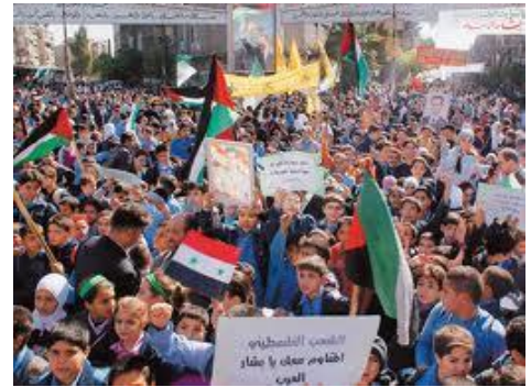
Syrians demand ouster of President Assad

2 in 3 respondents in the GCC and NA (67% and 66%, respectively) approve the Arab League's decision to impose sanctions on Syria. Those in the Levant, which would be affected the most, tend to oppose this